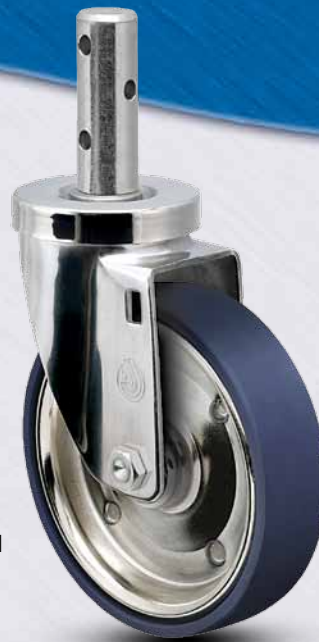
5-S32-113P (shown in photo)