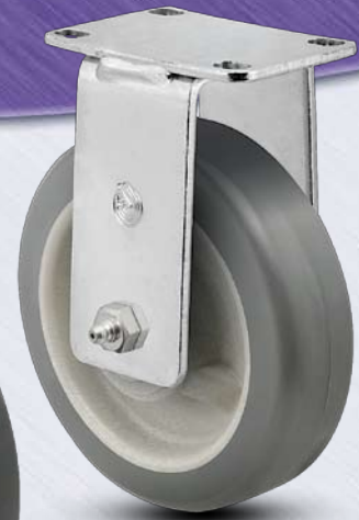
5-131-215GF PLT2 (shown in photo)