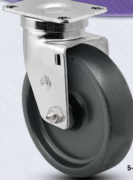
5-130-522 PLT2 (shown in photo)