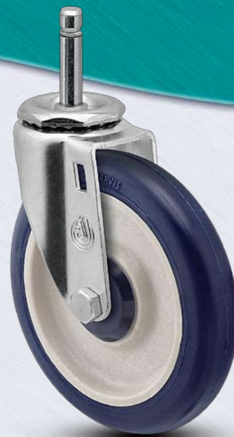
5-14-212P STEM 1 (shown in photo)